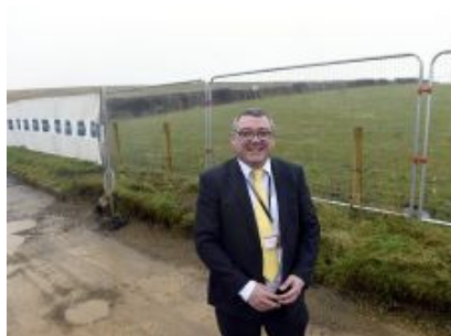
Land deal success for Carlisle's flood-hit Newman School