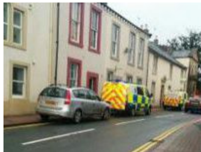
Police called to sudden death of man

"She used to make me go running with her in Hyde Park.